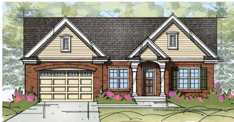
TRADITIONAL ELEVATION | 0' 4' 12' 3/32" = 1' - 0"