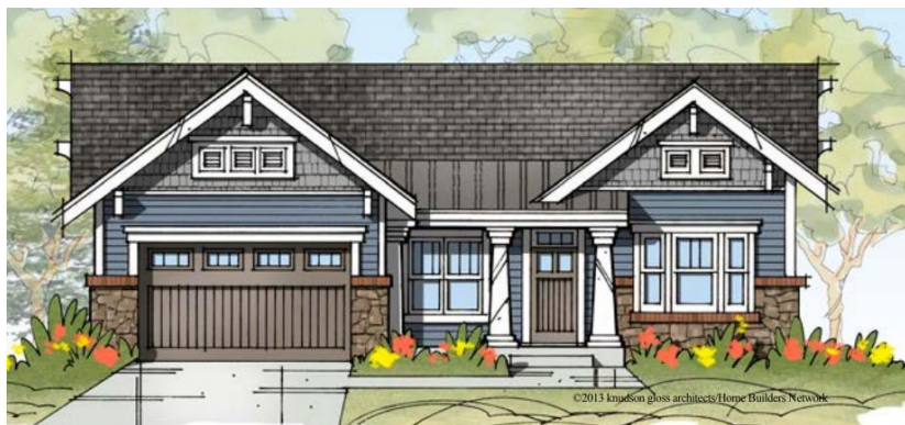
CRAFTSMAN ELEVATION | 0' 4' 12' 3/32" = 1' - 0"