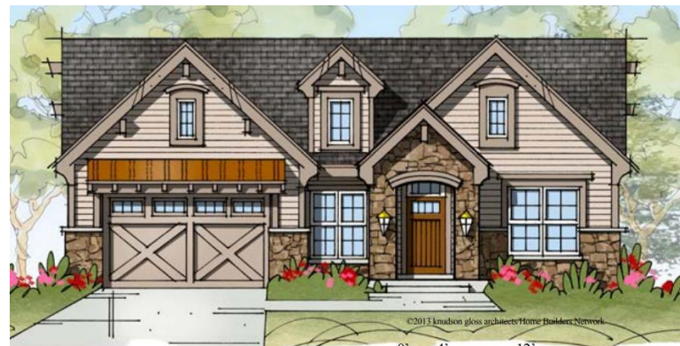
EURO-COTTAGE ELEVATION | 0' 4' 12' 3/32" = 1' - 0"